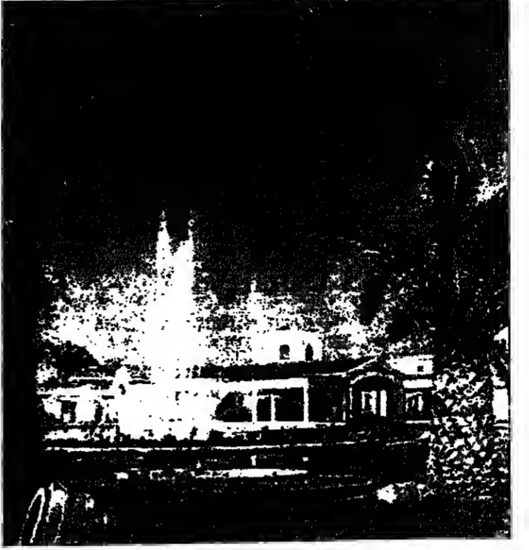
The Hyatt Regency Casino Thessaloniki is Europe's largest and most luxurious.

Poros and Hydrous are smaller islands, each with quaint shops and cafes. Hydrous's attractions are particularly charming: There are no motor vehicles on the island, only donkeys. Visitors can take a 20-minute donkey ride from the island's edge into its lush green hills studded with white and blue houses to explore a splendor strikingly different from the serene beauty of the sea.